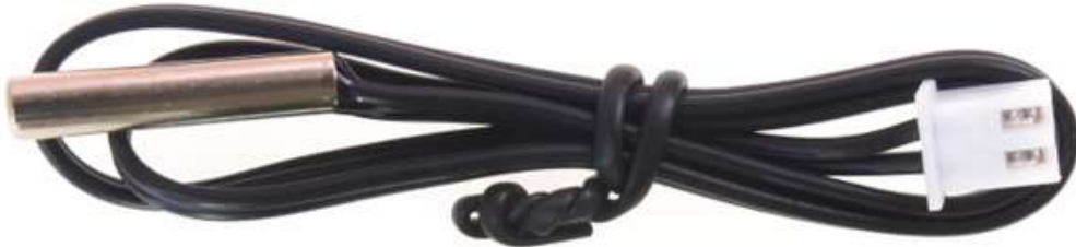
W1209 Temperature Control Switch