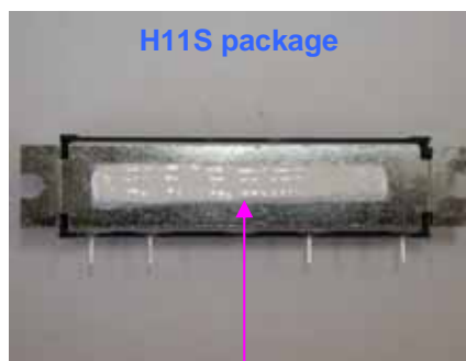
Thermal compound size: L40 x W5.0 x t 0.5mm