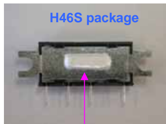
Thermal compound size: L10 x W3.0 x t 0.5mm